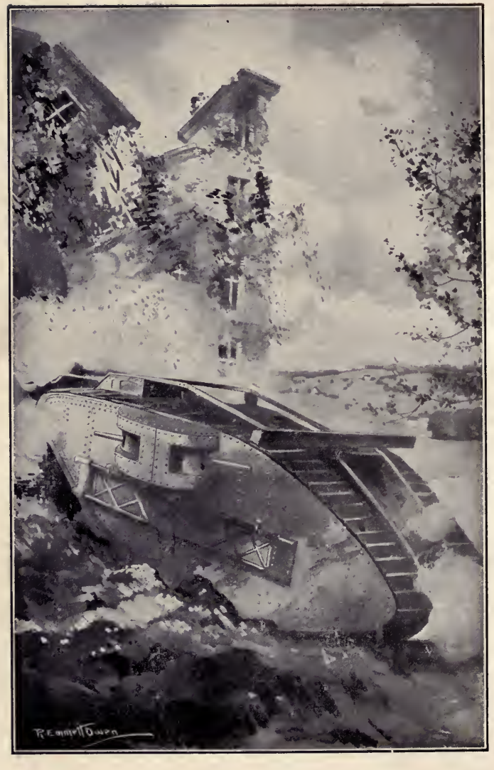
THERE WAS A CRASH AS THE GREAT WAR TANK HIT THE WALL AND CRUMPLED IT UP